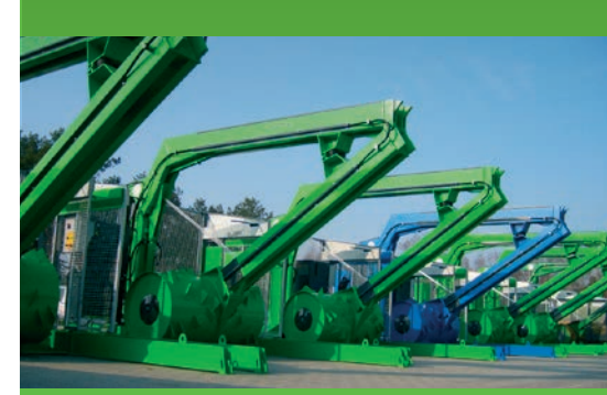
Ready for collection