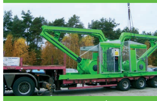
Transport RP 7700 Jumbo