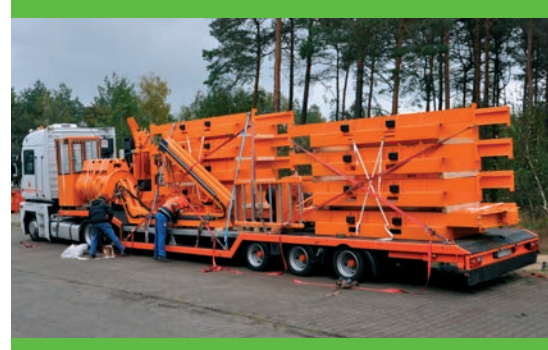
Transport RPV 7700 Traversing System for 10 container places