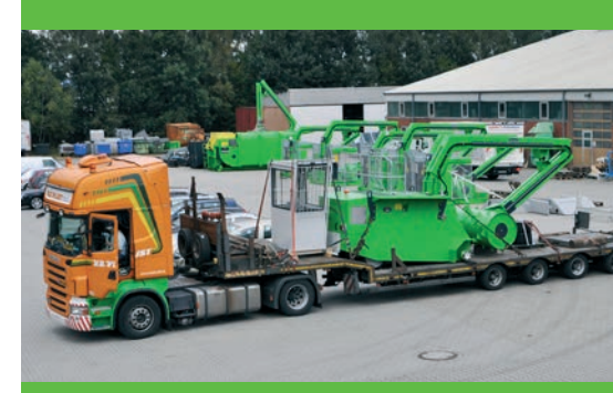
Transport RPM 7700 Mobile Jumbo